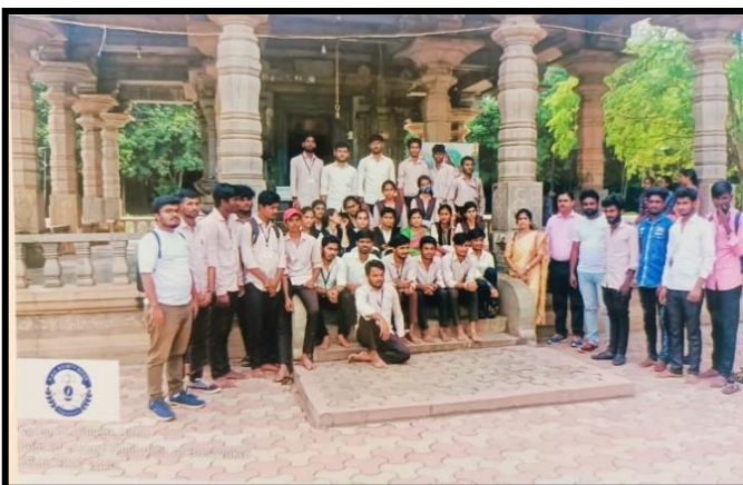
Field visit at Madivala Machideva Cave, Basavakalyan on 28/08/2022