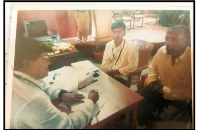
Student Personal Counseling