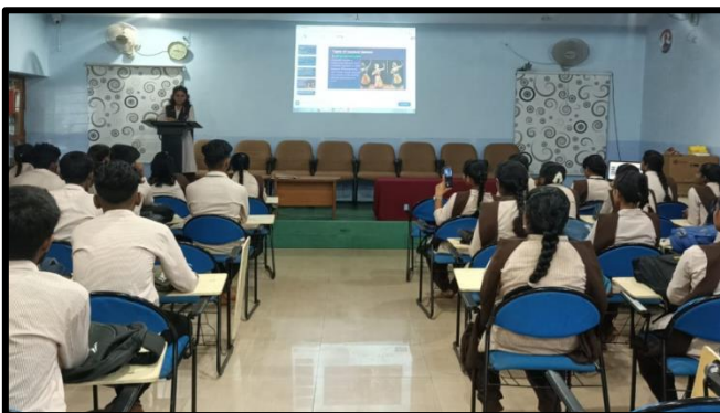
ICT Class by student