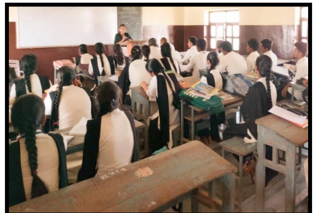
Class Seminar by Student