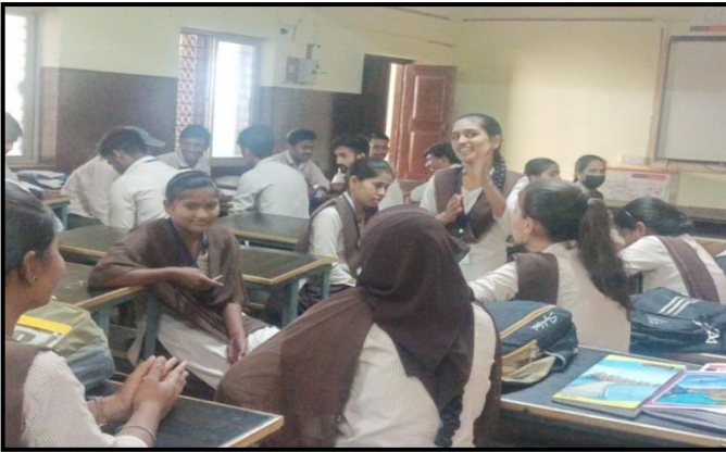
Group Discussion on the topic. “Importance of Historical Monuments”