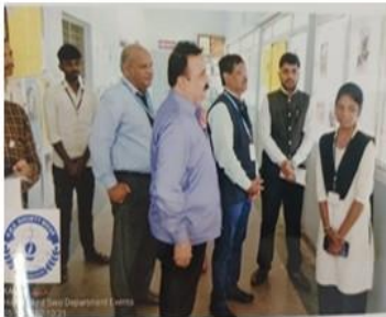
Poster Making Competition on Freedom Fighters of Hyderabad Karnataka