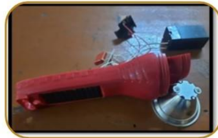
Solar Charging Torch