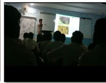
Video Documentary Competition on Karez System of Bidar