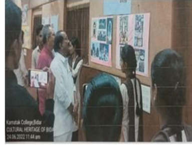
Poster Presentation Competition on Art and Architecture of Bidar Heritage