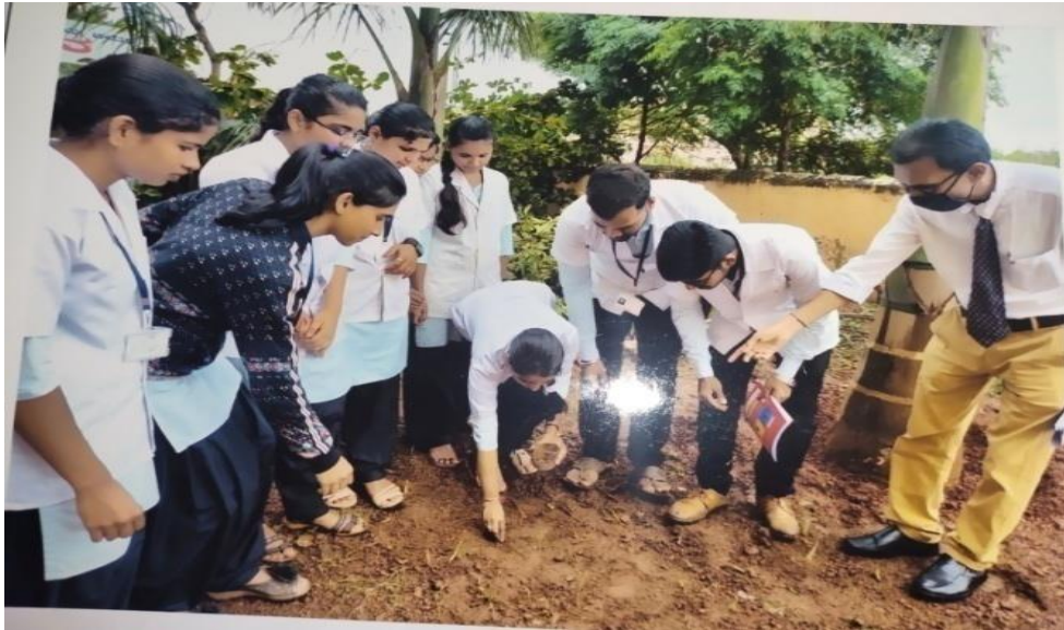
Soil Sample Collection at Polluted Site by UG Students of Chemistry