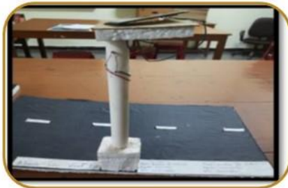
Solar Street Light