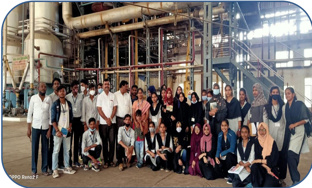
Industrial Visit at BSSK Sugar Industry