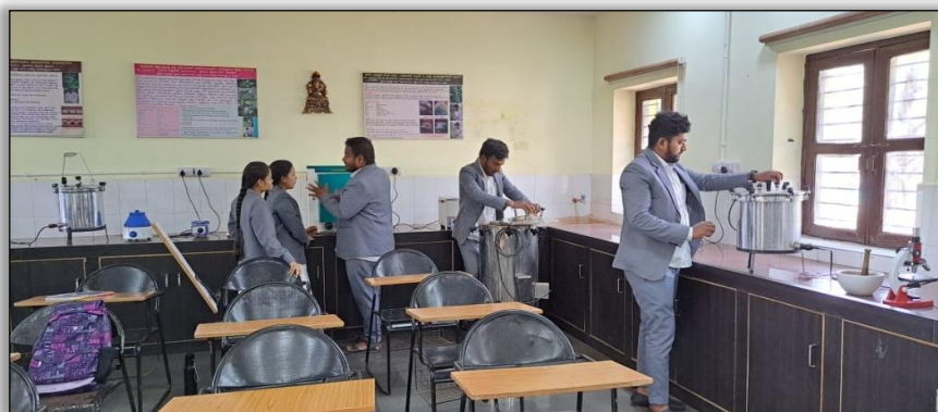
Students Involved in Hands-on Practical Training