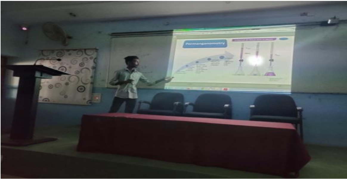
Students delivering the seminar