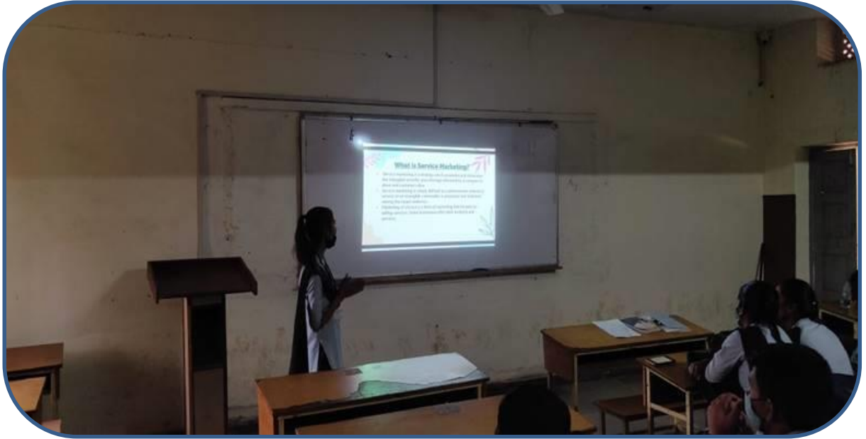
Innovative Business Idea Presentation by UG Students of Commerce