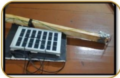
Solar Grass Cutter