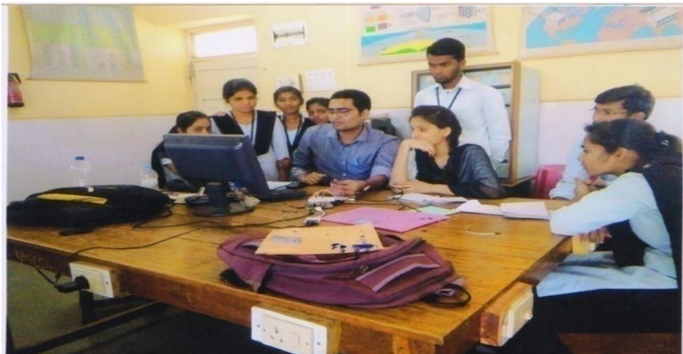
Real Time Project Development by UG Students of Electronics