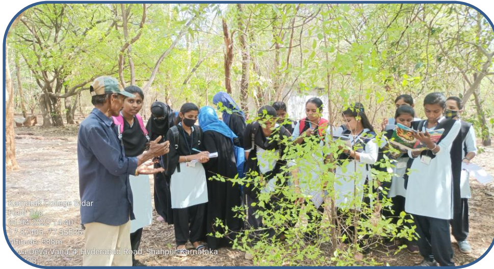
Students involved in Survey of Medical Plants with Forest Department Official