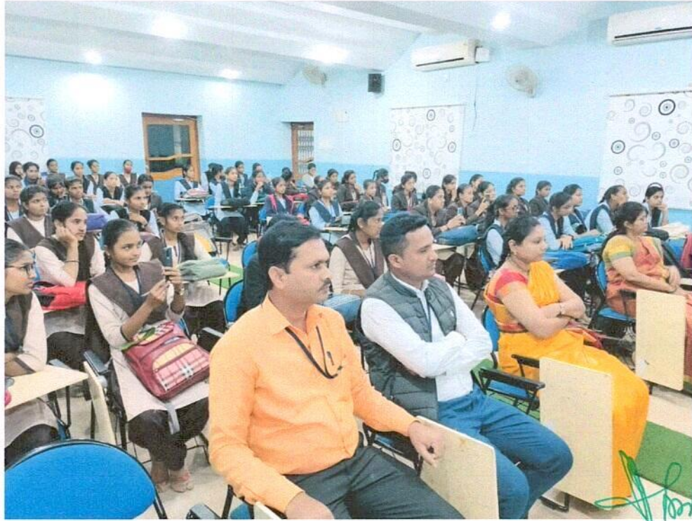
Students and Faculty members attending the awareness programme on Health and Hygiene organized by Department of Sociology on 17-08-2022

[Handwritten Signature] PRINCIPAL Karnatak Arts, Sci. & Com. College BIDAR-585401