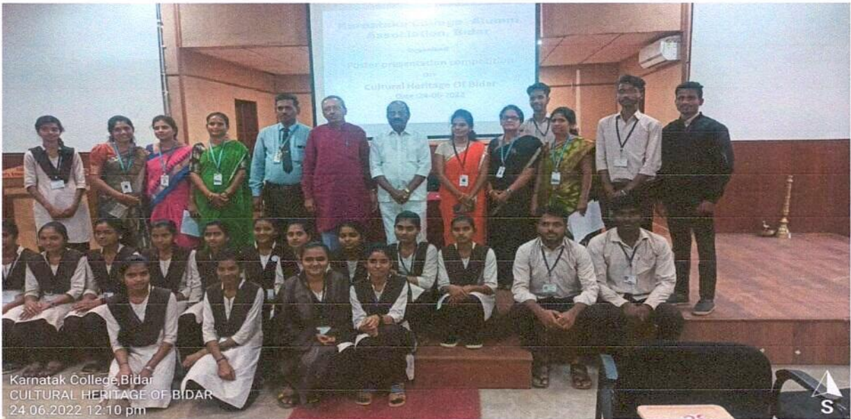
Group Photo of the Participants, Faculty Members and Guests during the poster presentation competition.