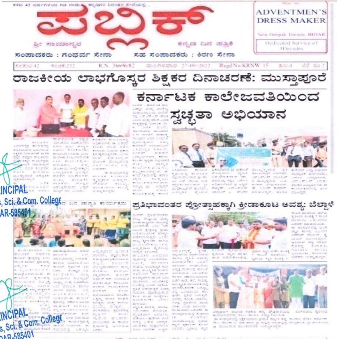
Swachha Bharat Abhiyaan Rally is appeared in daily Kannada news Paper Public on 27-09-2022