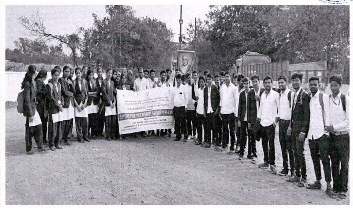
Group photo at Naranja Sugar Factory, Janwada.