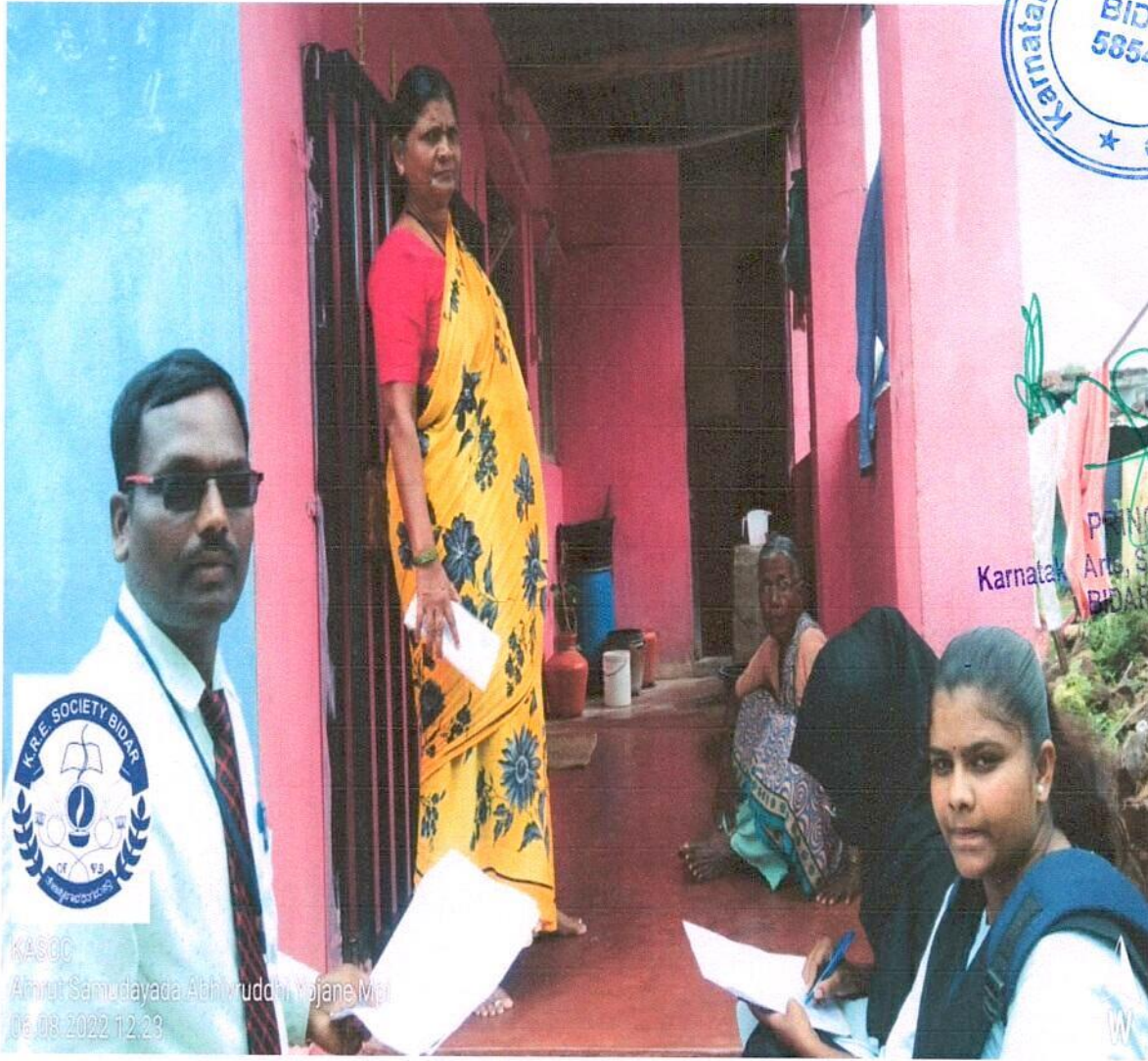
Volunteers are collecting data for the MPI survey under Amrut Samudayada Abhivrudhi Yojana on 6 August, 2022..