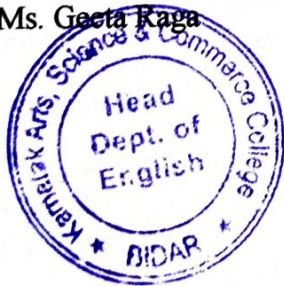
Ms. Geeta Raga

Permitted. for doing Extension Activity 18/07/22