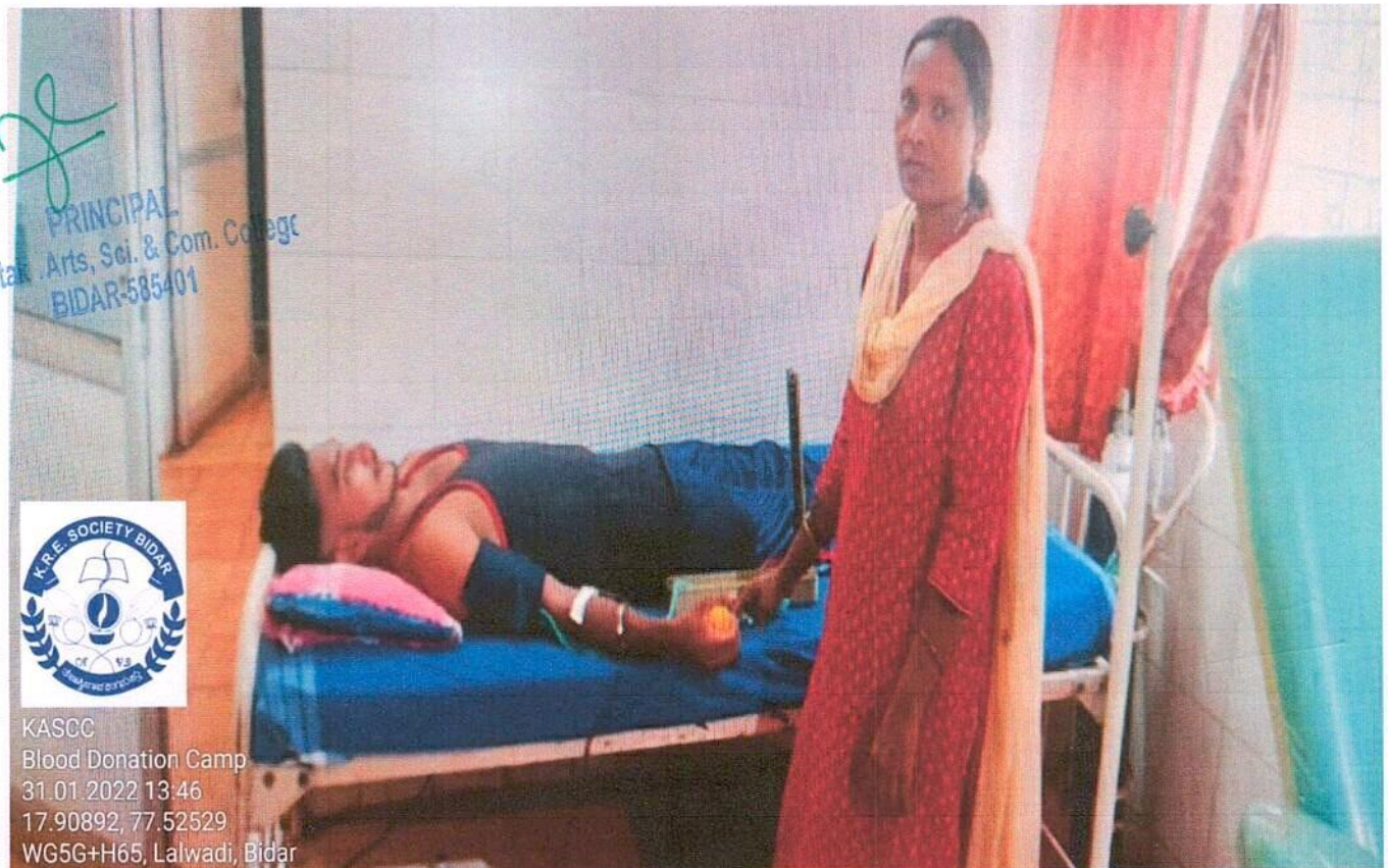
Cadet Donating blood of 250ml

Karnatak Arts, Sci. & Com. College BIDAR-585401