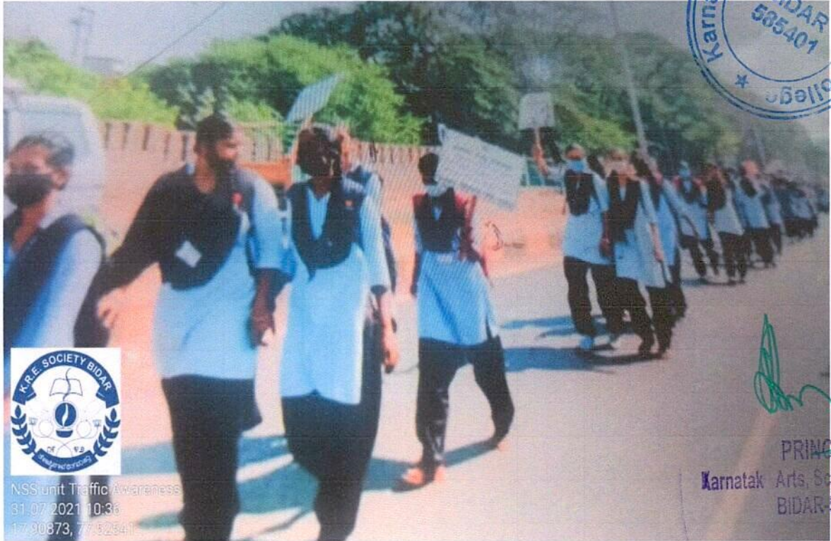
NSS volunteers are marching from the college campus to Ambedkar circle for the event of a traffic awareness rally 31 July 2021