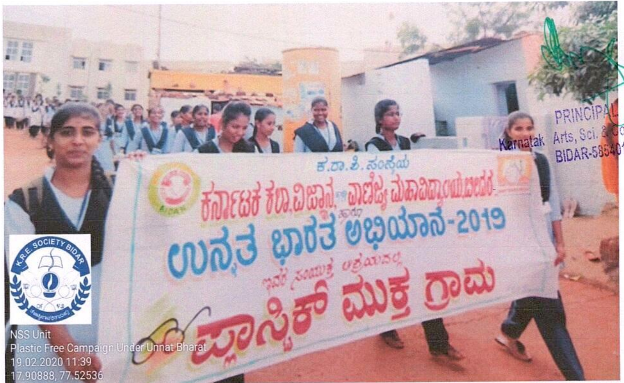
NSS volunteers are taking part in the Plastic Free Campaign rally under Unnat Bharat Abhiyan at Ashttor village 19 February 2020.

NSS Unit Plastic Free Campaign Under Unnat Bharat 19.02.2020 11:56 17.90885, 77.52551