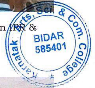
BA/B.Sc/B.Com/BCA & PG Students attended the Webinar on IPR & Innovations on 22/07/2022

KASCC, Bidar Impact Lecture Series -01 IPR & Innovation 22.07.2022 10:55 17.90887, 77.52559 WG5F+QWW, Hyderabad Road, Lalwadi, Bidar, Karnataka 585401