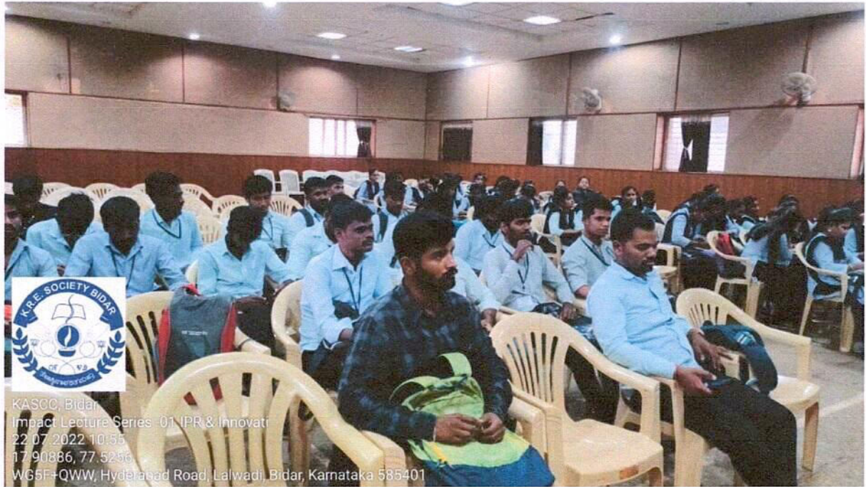
BA/B.Sc/B.Com/BCA & PG Students attended the Webinar on IPR & Innovations on 22/07/2022