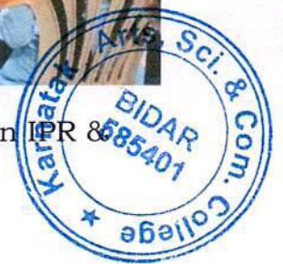
BA/B.Sc/B.Com/BCA & PG Students attended the Webinar on IPR & Innovations on 22/07/2022

KASCC, Bidar Impact Lecture Series -01 IPR & Innovation 22.07.2022 10:56 17.90887, 77.52559 WG5F+QWW, Hyderabad Road, Lalwadi, Bidar, Karnataka 585401