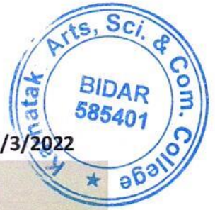
Photographs of the event: Workshop on Research Methodology organized on 7/3/2022