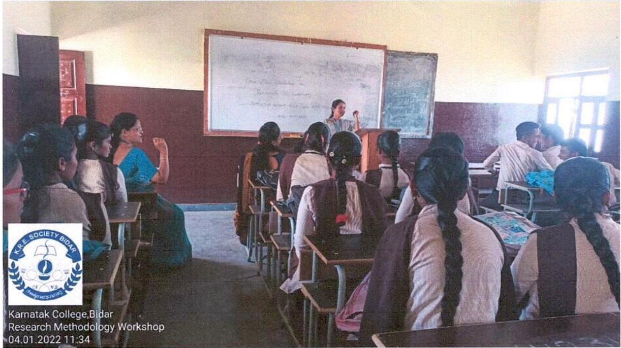
Karnatak College, Bidar Research Methodology Workshop 04.01.2022 11:34