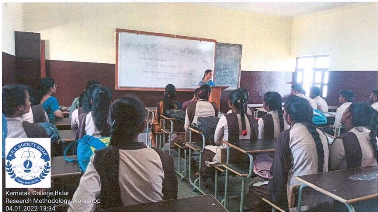
Karnatak College, Bidar Research Methodology Workshop 04.01.2022 13:34